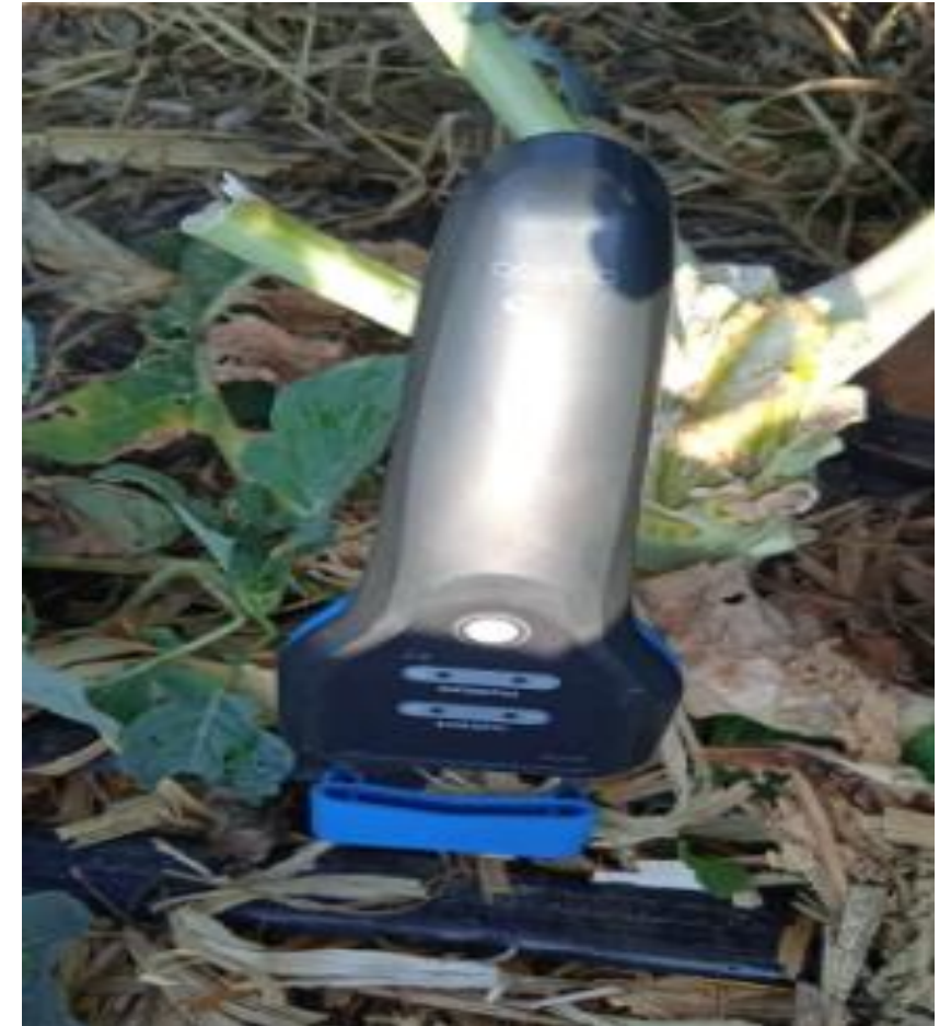
Bluelab Pulse Meter